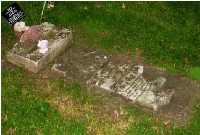
A child's grave is frequently decorated with toys