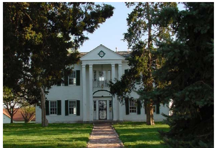
Lawson-Moore Home – Built 1856 Little BLUE Battlefield

Note: If you haven't picked up one of her brochures on Southern Missouri / Arkansas Battle Sites, we've got plenty left.