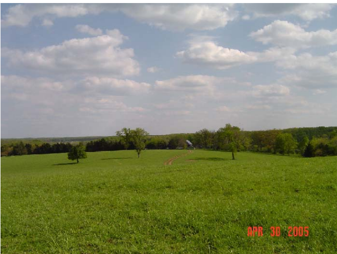
Battle of Cole Camp - Confederate Approach