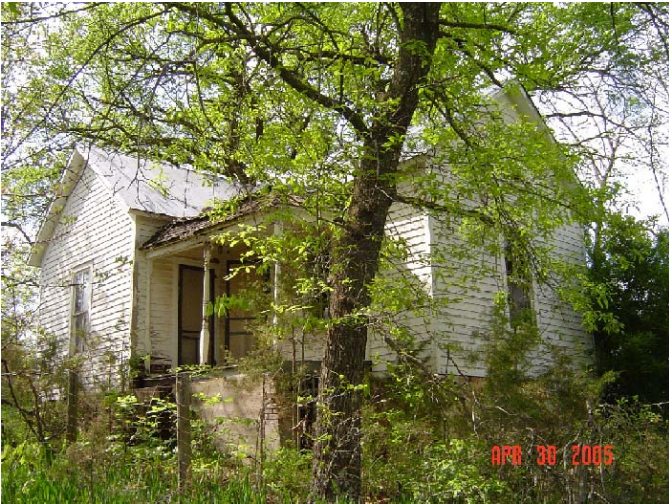
Jim Tyree Home, 1 st Battle of Cole Camp Casualty