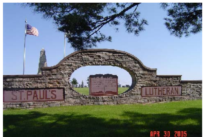
Concordia's St. Paul's Lutheran Cemetery