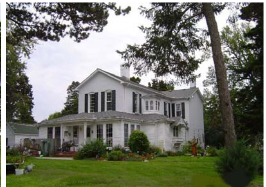
Pearson ("Chiles") Civil War Home ~ 30612 Blue Mills Road, Buckner, Missouri