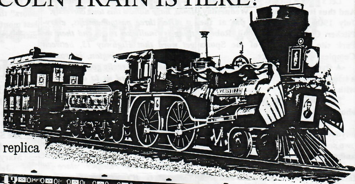
Lincoln train replica