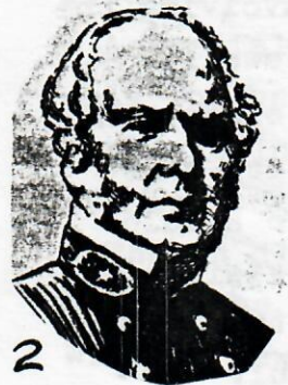
C Maj. Gen. James G. Blunt (1826-1881)