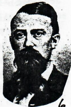
D Maj. Gen. John S. Marmaduke (1833-1887)