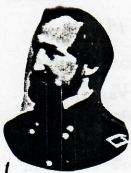
A Maj. Gen. Samuel R. Curtis (1805-1866)