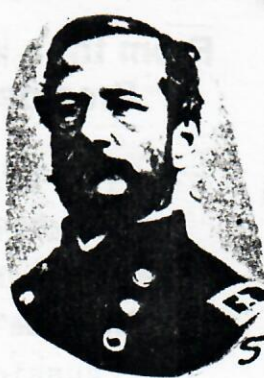
B Maj. Gen. Sterling Price (1809-1867)