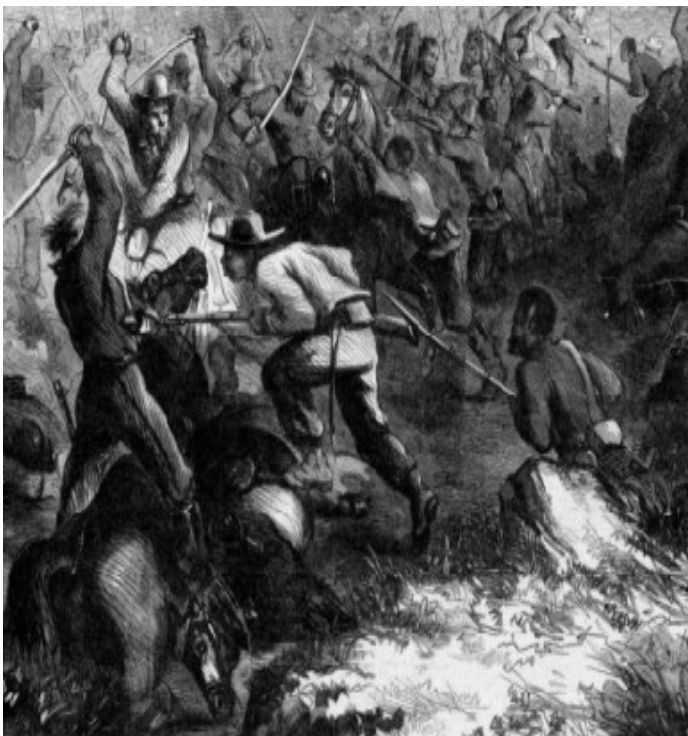
Harper's Weekly March 14, 1862

Alas, there is no memorial to the bravery and sacrifice of the African American troops that day. Ironically, the names of those men killed in the engagement, the first to be killed in action during the Civil War from an African American regiment, (1 white officer, 6 African Americans, and 1 Cherokee Indian) do not appear on the African American Civil War Memorial in Washington, D.C. The reason for the omission of their names is because the Skirmish at Island Mound occurred before the troops involved had actually been mustered into federal service and the names upon that national memorial were taken from the muster rolls and the Adjutant General's reports of the various states.